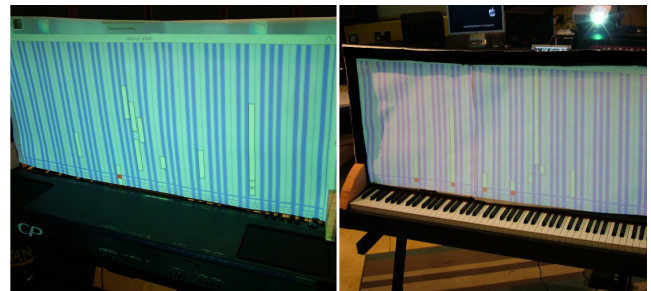
Figure 1: A front and back view of the projected display

Previous work in this area includes examples of computer based musical learning aids [2]. Work by Guillaume Denis and Pierre Jouvelot [3, 4] demonstrates the opportunity to create video games with the purpose of teaching music. The use of visual feedback in musical expression and its implications on mental workload was explored in François et al’s Mimi tool [5]. Also, games that already go some way as to use musical expression on a more simplified level are proving immensely popular. The Guitar Hero franchise (see Figure